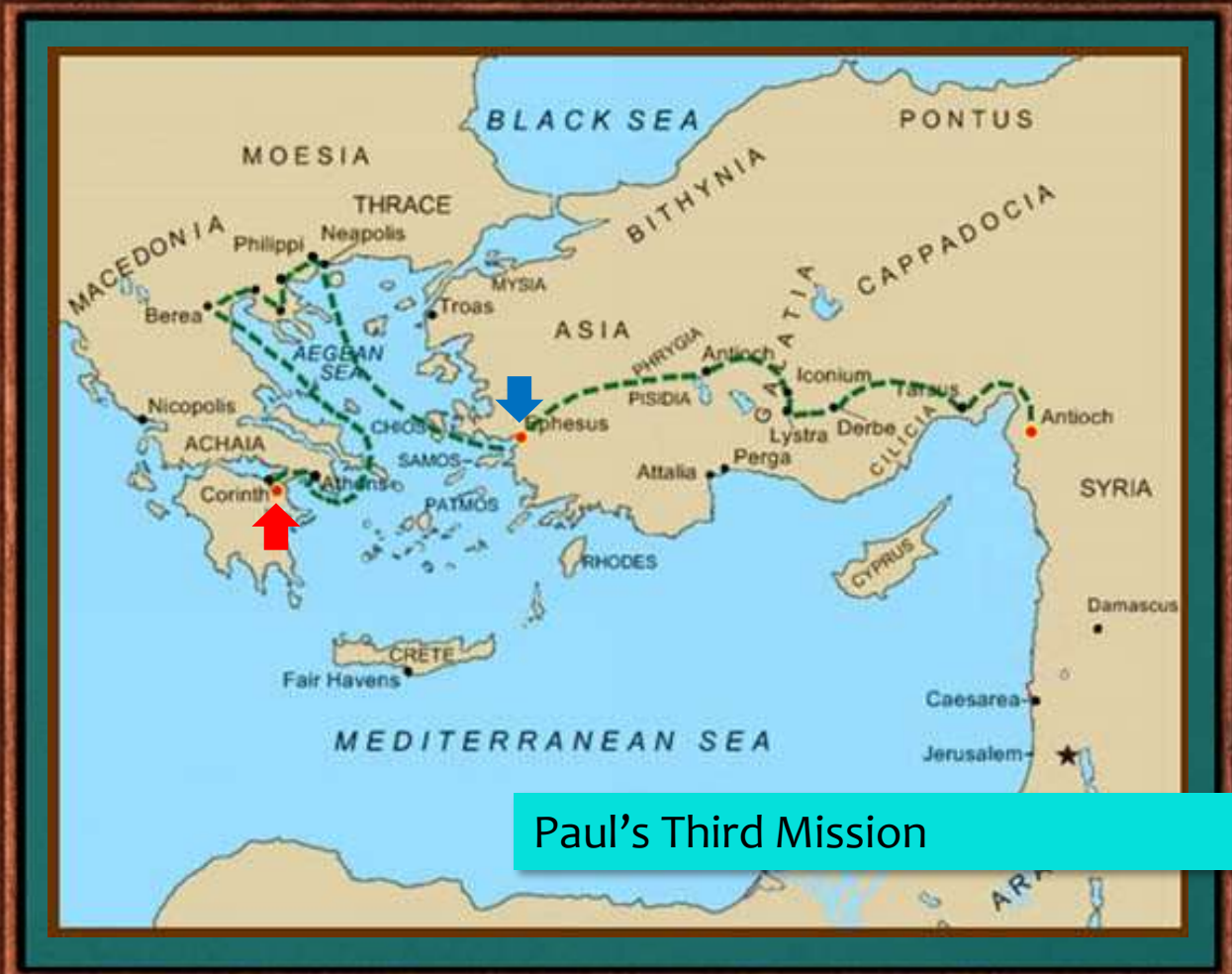
Paul's Third Mission

“When Paul wrote 2 Corinthians, traveling from Ephesus to Corinth, the collection was still incomplete. At the time he wrote to the church at Rome, this collection seems to have been completed.